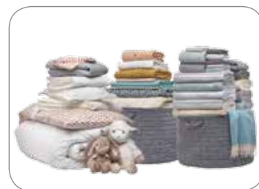
7.2 cu. ft. Capacity